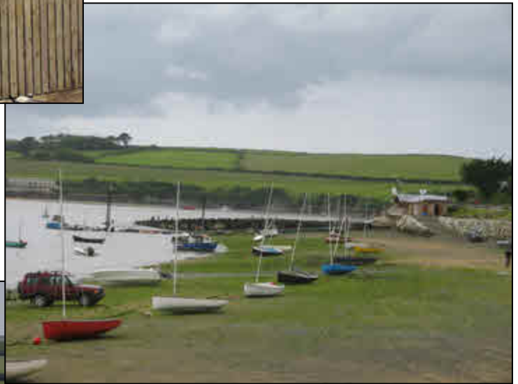
Dayboats at rest