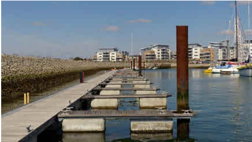
The Dayboat pontoon ready for the season