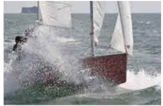
Icarus at Torbay