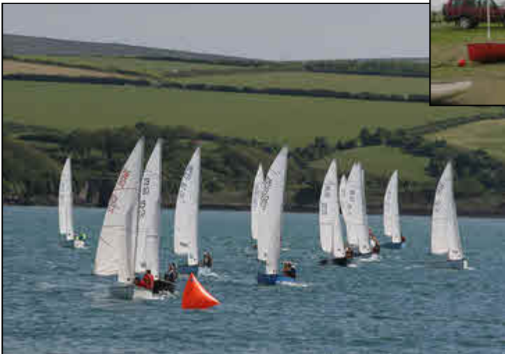
Dayboats at play